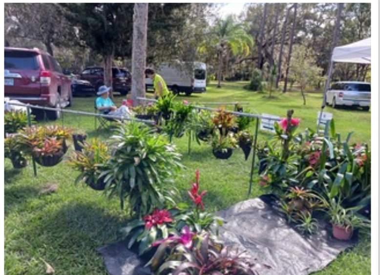
Scenes from the Growvember Sale