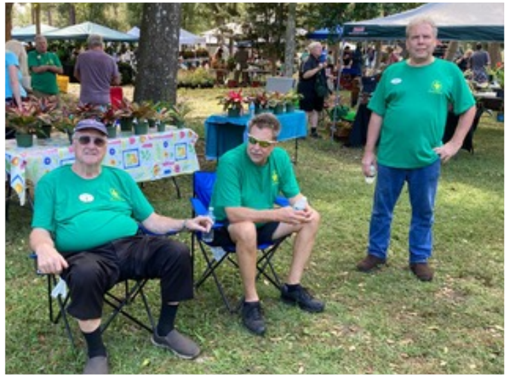
Scenes from the Growvember Sale