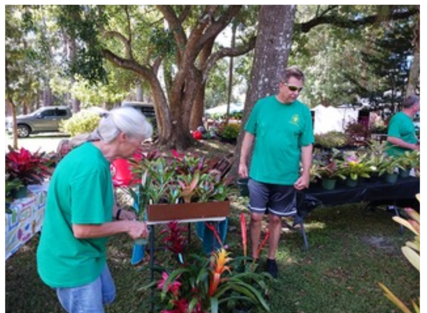
Scenes from the Growvember Sale