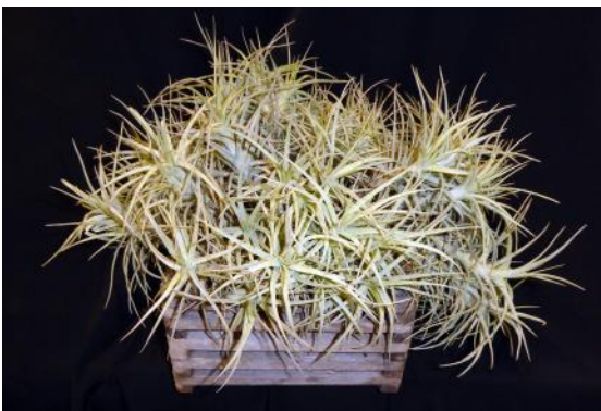
Best of Division III Exhibitor: Terrie Bert Tillandsia tectorum X Tillandsia balacea