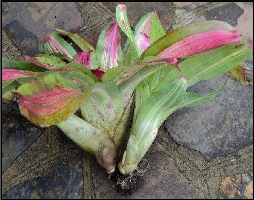
A pup ready to be removed from the basal root area on Neoregelia 'DeRolf'.

one of decent size. By removing pups from most bromeliads, you speed up the process of the mother plant perhaps producing one or more pups. The other type of pup seen on Lutheria glutinosa were grass pups. These grow around the base of the mother and in the case of some Alcantarea varieties, they are the only type of pup the mother produces. When big enough they can be carefully removed and grown on. A tip: these grass pups can be placed in the water of the cup of another bromeliad where they root easily before potting them on. · (Normal) Pups are ready to be separated when they reach about half to 2/3 the size of the parent plant. If the pup is starting to form roots, that's a good indication that the plant can survive on its own. They do not necessarily need to have roots in order to survive and begin life. They will form roots. Remember that (many) bromeliads take in moisture and nutrients through their leaves and most can survive as epiphytes and can be mounted. (CBS Editor: The terrestrial bromeliads absorb their nutrients and moisture through their roots and should be planted in media.) Roots are mainly to anchor the (epiphytic) plants, to provide stability when potted, or on a host, eg. a tree trunk. Pups may be removed by cutting with a sharp knife or secateurs as close to the mother plant as possible. The bigger varieties may need a small saw to cut through the woody stem. Try not to damage the mother plant as it might produce more pups. Some pups can be pulled