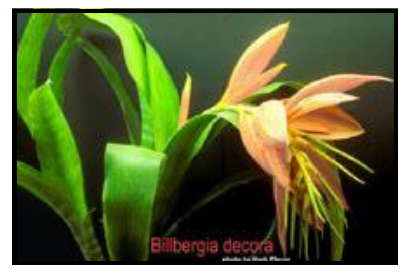
Billbergia decora was first introduced into cultivation in 1831 from the rain forest of Peru, Bolivia and Brazil. It has green petals and peach colored bracts.