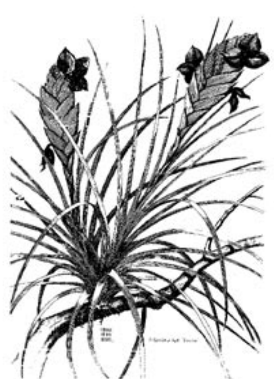
The BSI Journal cover drawing by M.H. Hobbs of the hybrid of T. cyanea and T. lindenii named Tillandsia 'Emilie'.

Although these two plants are two distinct species, their similarities