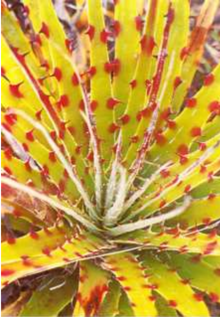
Hechtia texensis

of color into the leaves from the spines.