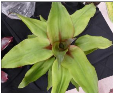
Aechmea tayoensis short petiole