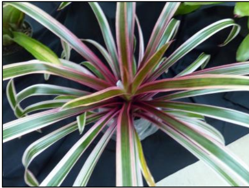
Guzmania 'Sir Albert'