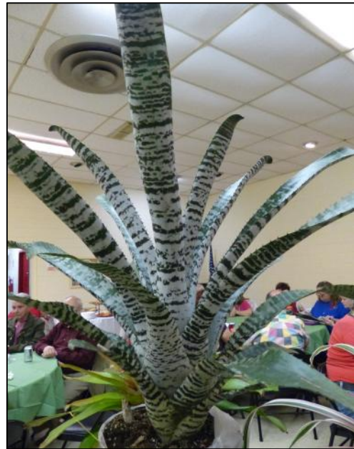
Aechmea 'Deleon' dark form