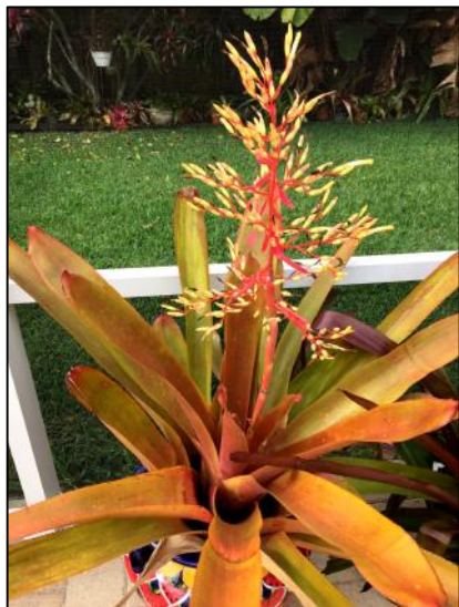
Portea 'Tambora' (? See note below)*

Many bromeliads get their best color in the winter when the sun is lower on the southern horizon and less strong than the summer sun. Here are three that are exhibiting great color this month.