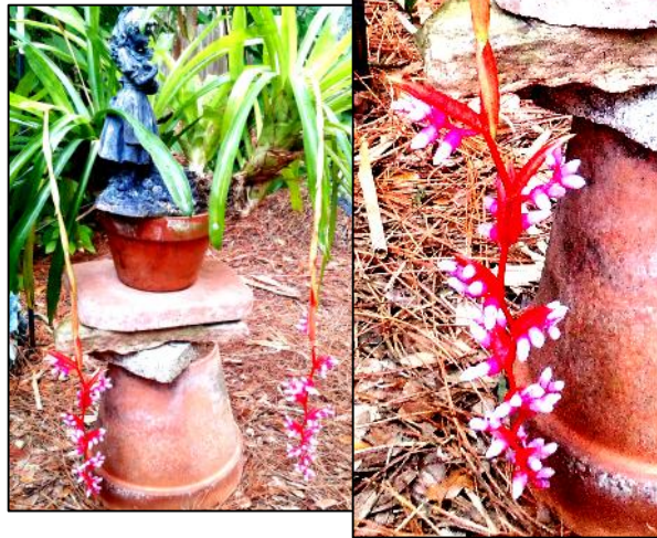
Aechmea weilbachii forma pendula