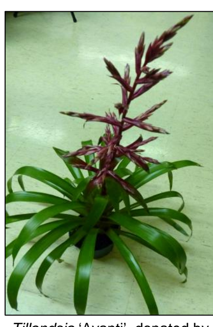
Tillandsia 'Avanti', donated by