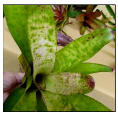
Neoregelia 'Ice White River'