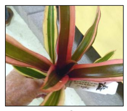
Neoregelia 'Spicy Hot'