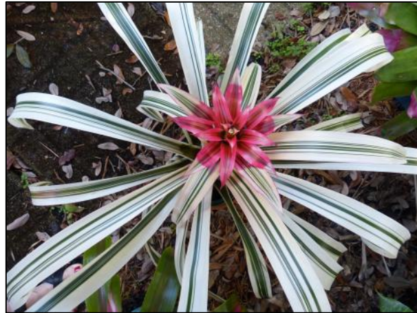
Guzmania 'Sir Albert'