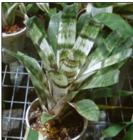
Vriesea "Smudge Grub"