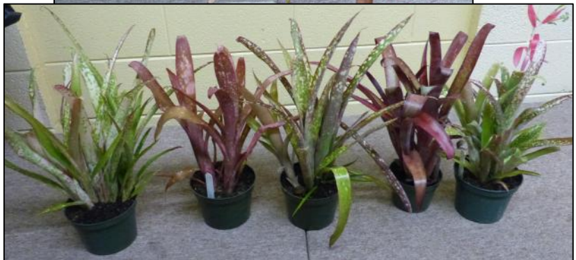
Five different hybrids from the same cross: Bil. 'Pixie' x Bil. 'Fantasia'