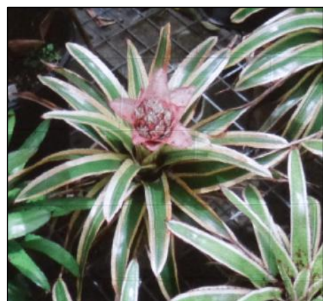
Canistropsis hybrid albomarginated