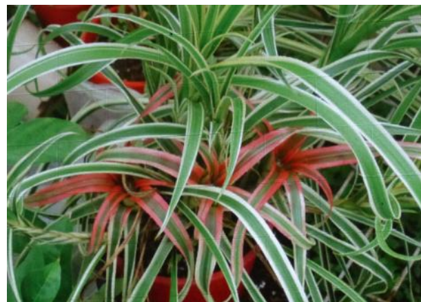
Subgenus Neoregelia species