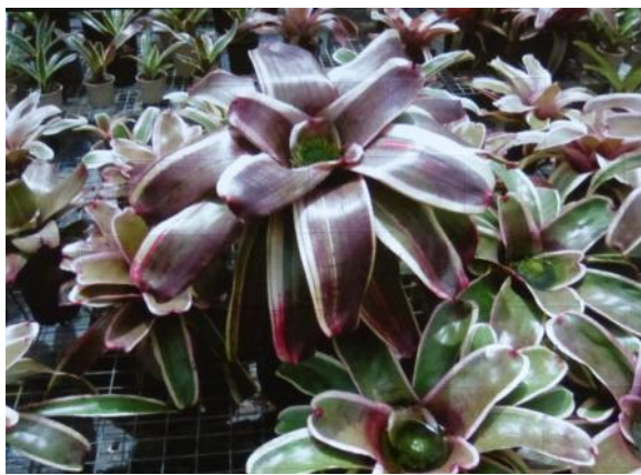
A very large Neoregelia hybrid