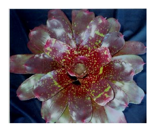
Neo. "Charming DeRolf"