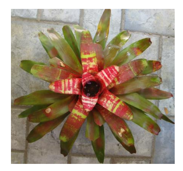
Neo. 'Mercury Is in Love'