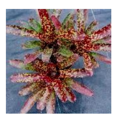
Neo. 'Lemon Drop'