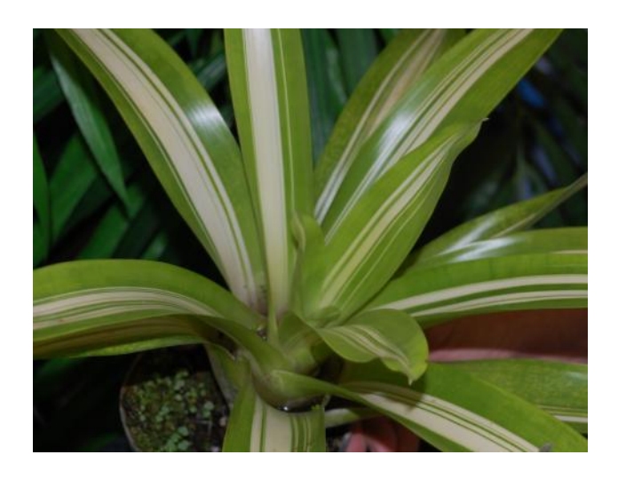
Vriesea 'Andy's Dream'