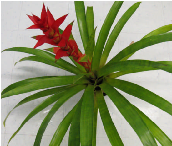
Guz. 'Irene' (red form)