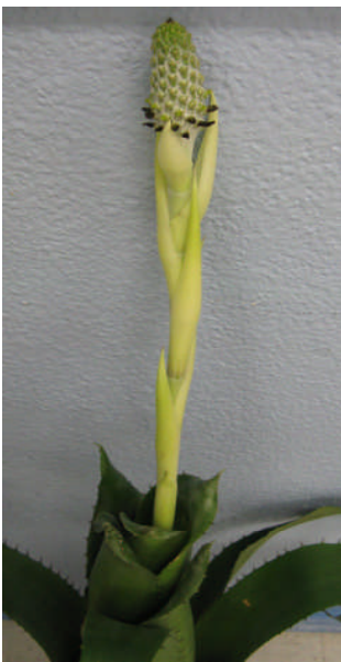
Aec. bromeliifolia albobracteata

← ← ← Compare this Aec. bromeliifolia variety albobracteata shown at the last meeting with this Aec. bromeliifolia → → form shown at the previous (February) meeting.