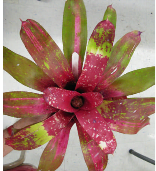
Neo. 'Treasure Chest'