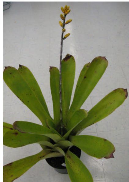
Hoh. urbaniana →→