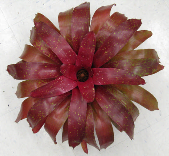
Neo. 'Treasure Chest' X 'N. Bingito'