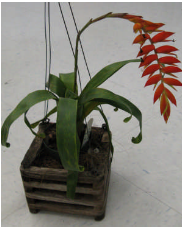
←← Til. dyeriana