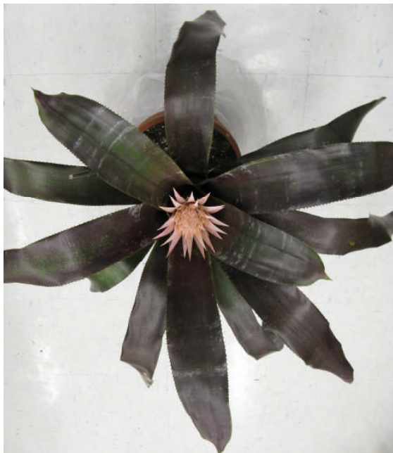
Aec. fasciata 'Sangria'

Below are pictures of Show and Tell plants.