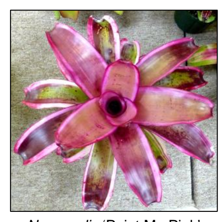
Neoregelia 'Paint Me Pink'