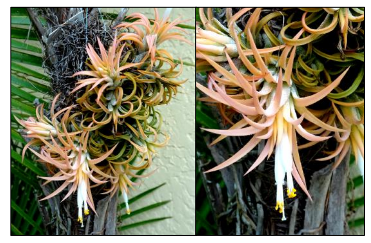
Tillandsia ionantha 'Druid'