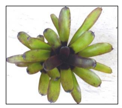
Neoregelia 'Midnight Dung'