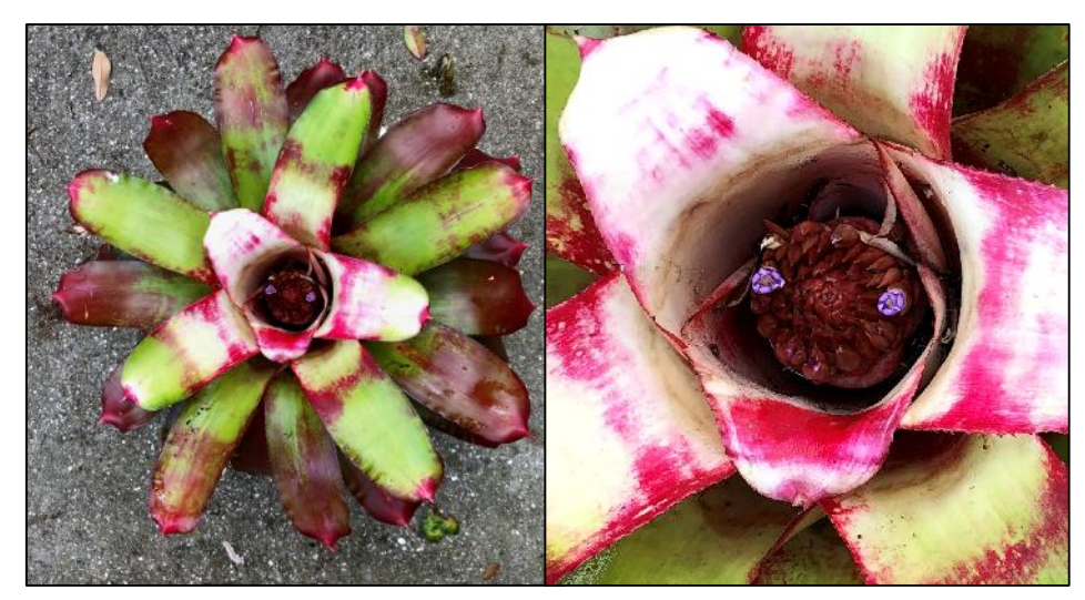
Neoregelia 'Strawberry Jamboree'