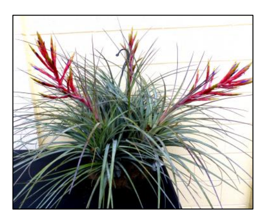
Vriesea fasciculata x densispica