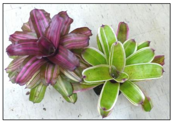
From same cross: Neoregelia 'Sichuan' (left); Neoregelia 'Road to Hana' (right)