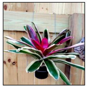
Neoregelia in bottom picture placed in the wire hanger shown in the upper picture.