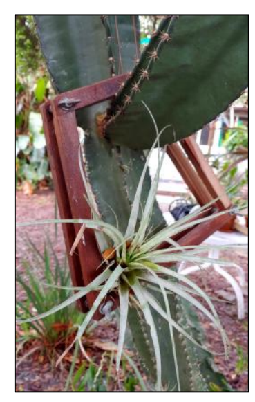
Tillandsia mounted on an old tennis racket press and hung from a cactus arm.

President Barb Gardner submitted the pictures below that show some of the creative ways she displays bromeliads, sometimes using unexpected items as the mount or hanger.