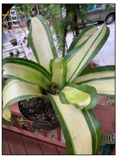
Neoregelia 'Arctic Blast' Plants with this much white are typically hard to grow well.