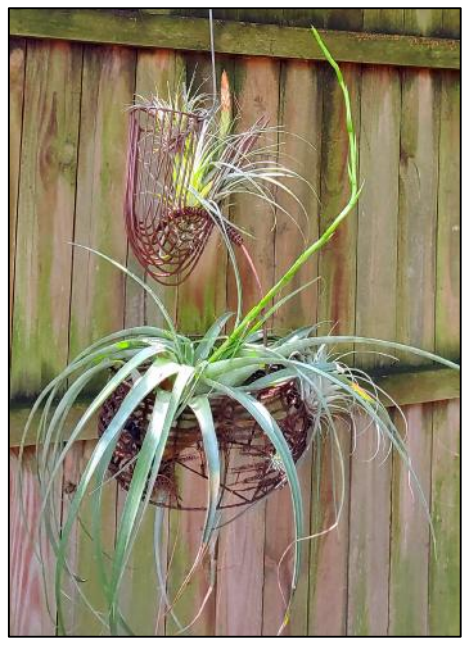
Tillandsias in a wire rooster and a bottomless wire basket.