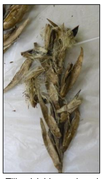
Tillandsioideae: winged seeds, feathery plumes in dry capsules