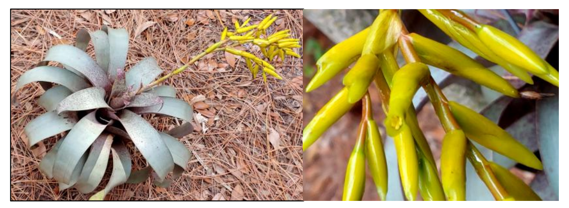
Vriesea sandersii . Frosty olive-green leaves with speckled raspberry spots; saffroncolored inflorescence with stamens and pistils are shorter than petals.

These pictures and comments were submitted by Barb Gardner.