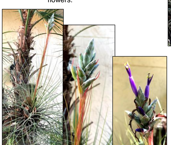
Tillandsia juncea forma Juncifolia