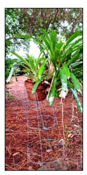
Neoregelia set on a tomato plant trellis.