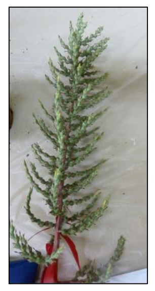
Bromelioideae: berry-like seeds