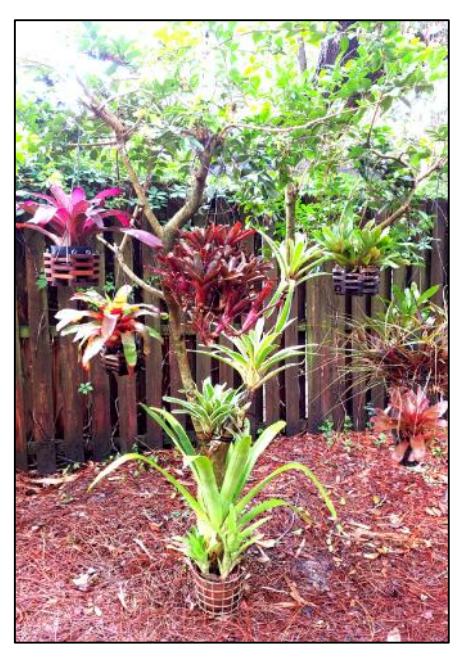
Bromeliads hanging in a Simpson's stopper tree.