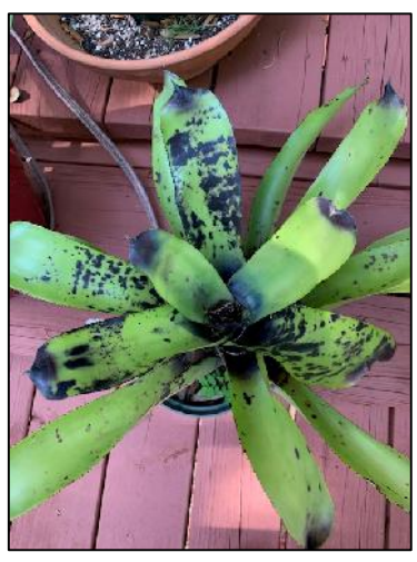
Aechmea caudata cv 'Blotches' Blotching will increase with summer sun.