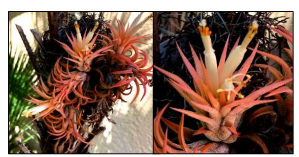
Tillandsia ionantha 'Druid', an ionantha with peach-colored leaves and white flowers, not the usual reddish blush leaves and purple flowers.