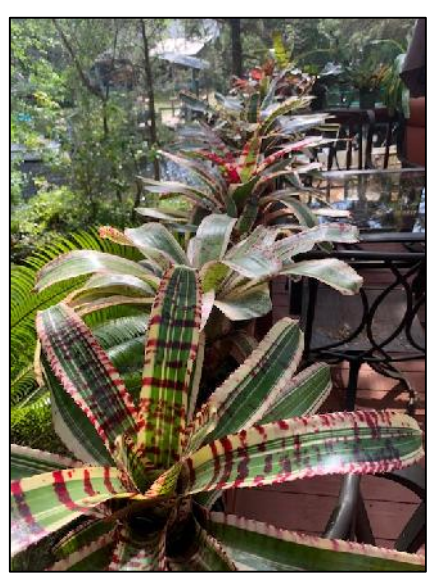
Neoregelia 'Star Wars' in a row with its pups