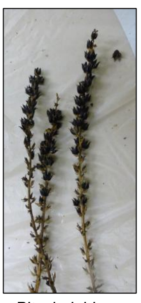
Pitcairnioideae: wingless seeds in dry capsules

There are multiple methods used in the bromeliad world for growing from seed and Marty demonstrated the basics of his preferred method for growing the fruit-like, berry seeds from plants in the Bromelioideae sub-family.