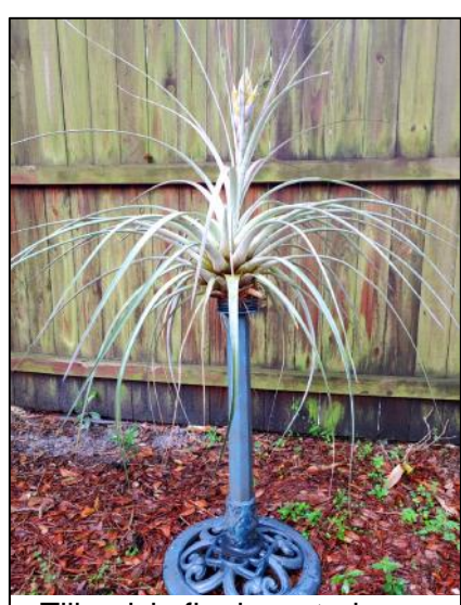
Tillandsia firmly rooted on a plastic bird bath base.