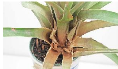
PHOTO 2 - Pup base revealed

STEP 2 - Strip the parental leaves that are covering the pup by separating them in the center lengthwise. You will then be able to visualize the entire base of the pup, as shown in Photo 2, right.