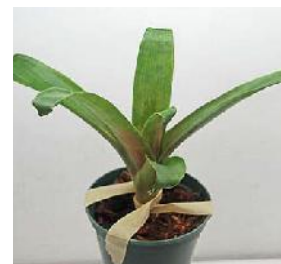
PHOTO 5 - Pup potted and stabilized 5 days later.

STEP 6 - When the base of the pup has sufficiently callused, place the pup in a medium in which it will rapidly grow roots and establish itself to grow on its own. The area around the base should be consistently moist but not wet. In that area I would place presoaked pieces of peat moss (or sphagnum moss) that will retain moisture for a reasonable period. You can drop some potting soil into the hole to fill up the spaces, as rooting is encouraged when the base is more tightly surrounded by the medium. To keep the pup stabilized and immovable during this initial period, I place two strips of masking tape overlapping across the top of the pot to tightly firm up the pup. This temporary brace should be removed when the pup is stabilized with its own roots. See Photo 5, right.