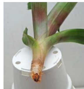
PHOTO 3 - Freed base showing roots

STEP 3 - Make a horizontal cut below the pup base and downward vertical cuts on each side of the base to below the base and into the parent. Then place the sharp knife between the pup and the parent with the blade slightly angled toward the parent. A smooth downward cut all the way down will free the pup from its parent. Do not apply any outward pressure on the pup while cutting down to free it. If the knife is really sharp you won't need to push or apply pressure as the blade will do the work. When this pup came free from the parent I was happy to see that the base was intact and that it was showing roots at the bottom, as shown in Photo 3, right. Now that the pup is free from the parent, we must take additional steps to assure that it will remain healthy, free from infection and to prepare for its eventual safe potting in a medium.