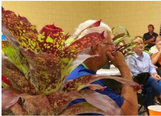
Plants, plants and more plants