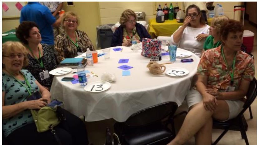
The 'girls' contemplate bidding.