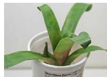
PHOTO 4 - Pup suspended in container

STEP 5 - During this period I like to suspend the pup in air so the base is not touching anything. I accomplish this by hanging the pup in a clean yogurt container with the leaves hanging over the top circumference as shown by Photo 4, right. I also occasionally lightly spray the base with Safer's Soap.