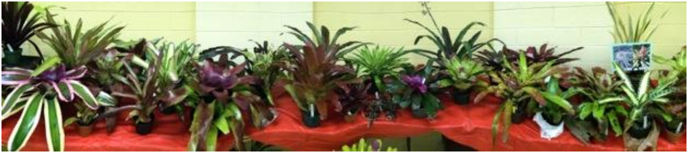
Some auction plants