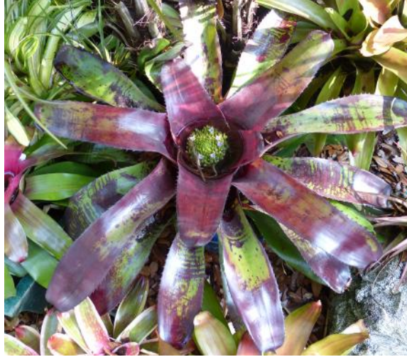
Neoregelia 'Ray LeMieux'