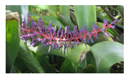
Aechmea 'Shelldancer' (Aec. fendleri x dichlamydea)