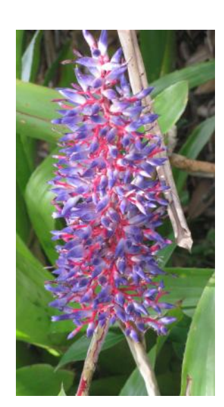
Aechmea fendleri cultivar