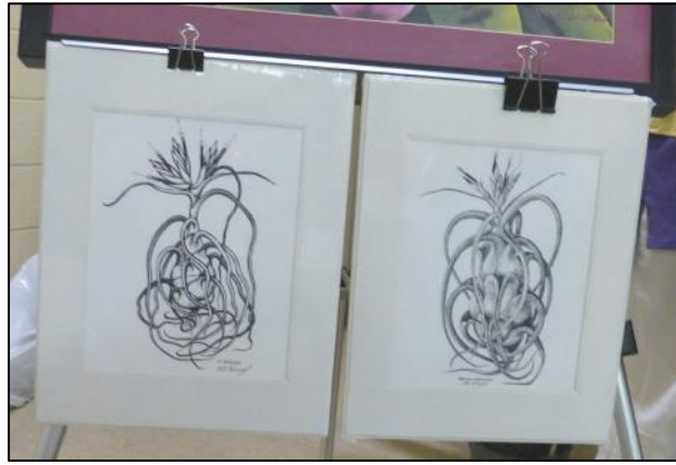
Art by Kiti Wenzel