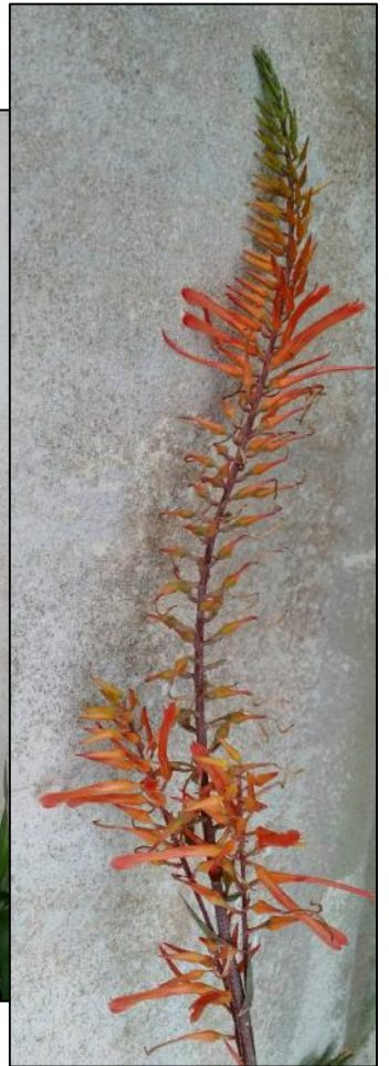
Pitcairnia , unknown species (Submitted by Barb Gardner)