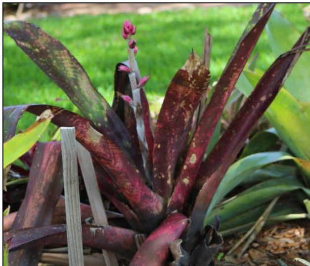
Hohenbergia rosea