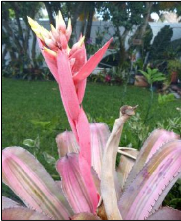
Aechmea Loie's Pride