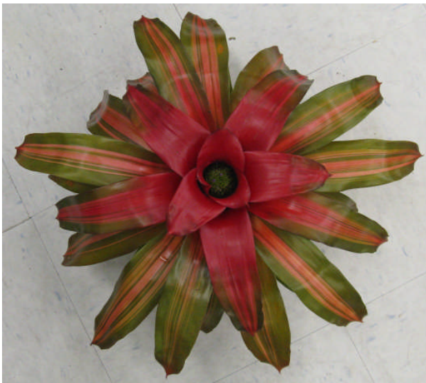
Neo. 'Orange Crush'

Helga Tarver Til. didisticha ; Til. concolor ; Til. streptophylla ; Til. streptophylla x Til. concolor ; Til. paucifolia ; Til. hammeri ; Guz. 'Wendy'