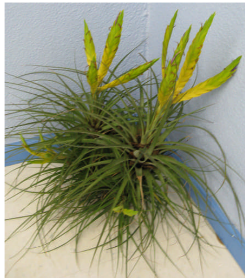
Til. fasciculata var. uncispica