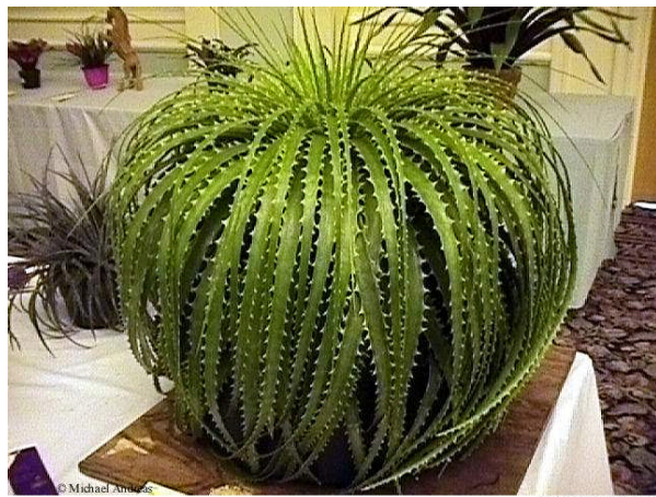
Encholirium horridum 13th World Bromeliad Conference, Houston, Texas July 1 - 5, 1998