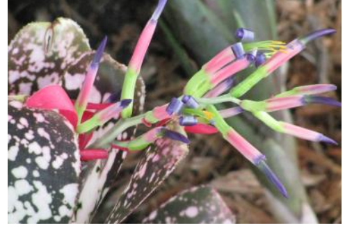
Billbergia 'Moulin Rouge'