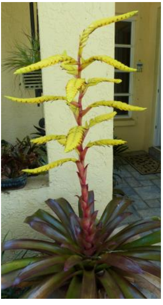
The x Vriecantarea 'Seeger' shown above on the left as it was last January just beginning an inflorescence and on the right with its inflorescence currently in full bloom.