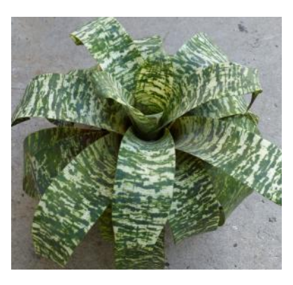
V. 'Hawaiian Magic' (V. gruberi white form)