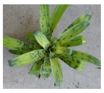
V. gruberi 'smudge' pattern