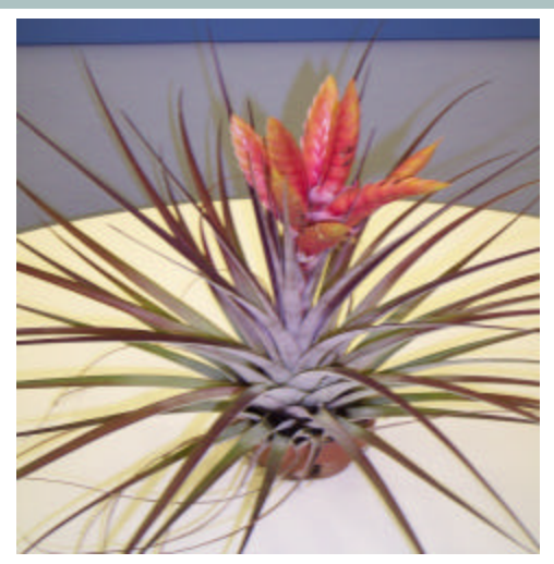
Tillandsia fasciculata 'Magnificent'