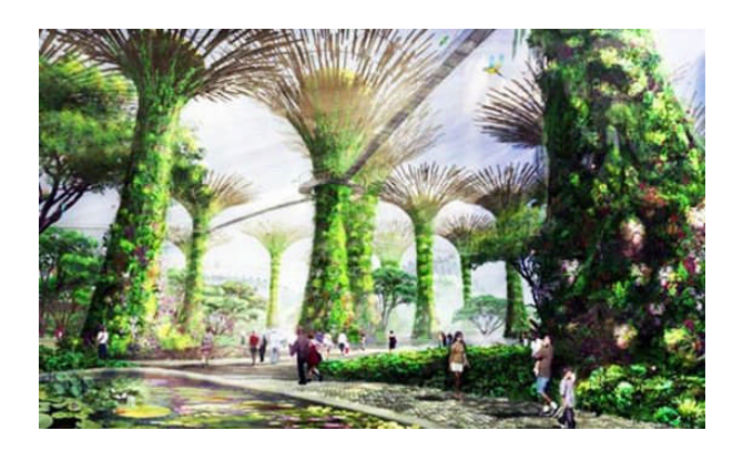
Super Trees with vertical gardens