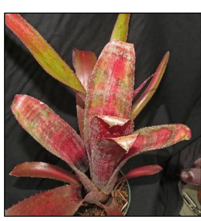
Billbergia 'Ben's Blotches'