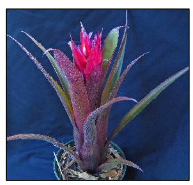
X Billmea 'Sangria'