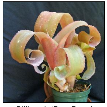
Billbergia 'Brut Rose'