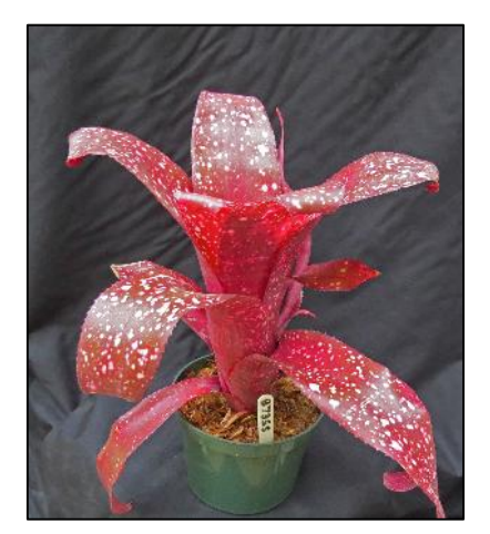
Billbergia 'Lois Special'