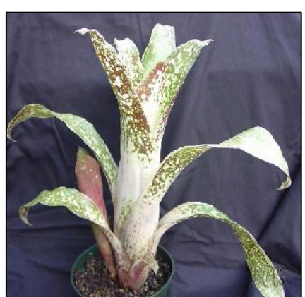
Billbergia 'Allison Sill'