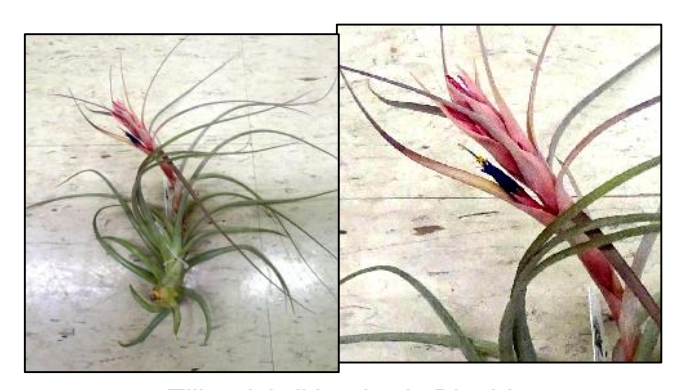
Tillandsia 'Heather's Blush'

Karen Mills Neoregelia 'Yang' (photo below)