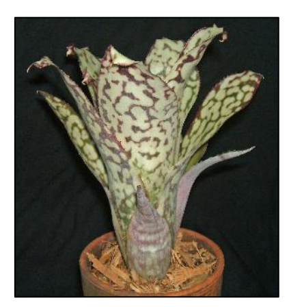
Billbergia 'Millie's Cup'