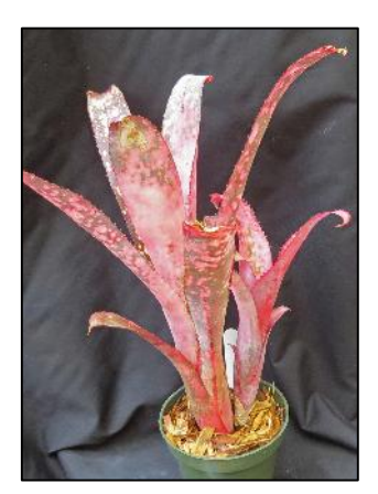
Billbergia 'Dawn Supreme'