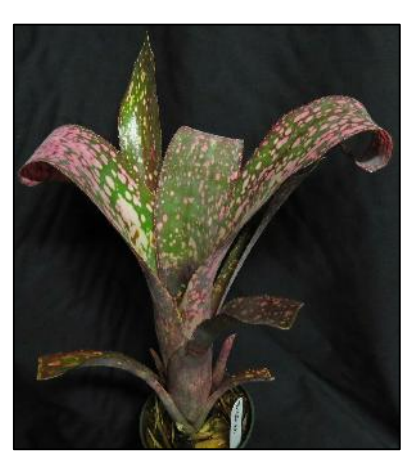
Billbergia 'Dave's Delight'