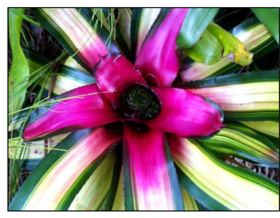
Neoregelia 'Mendoza' Submitted by Peggy Goodale