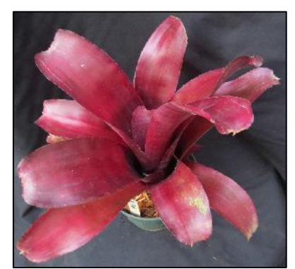
Billbergia 'Red Aplenty'