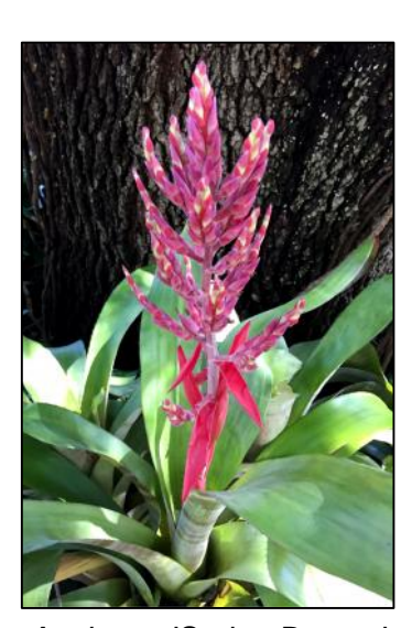
Aechmea 'Spring Beauty'