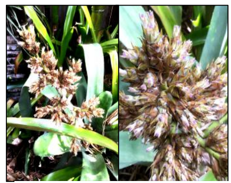
Wittmackia caymanensis

http://www.iucnredlist.org/details/56499801/0.