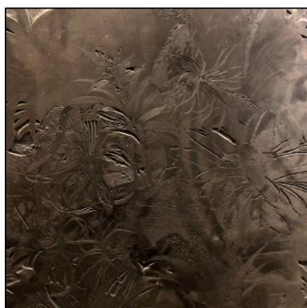
Close up of a section of the block