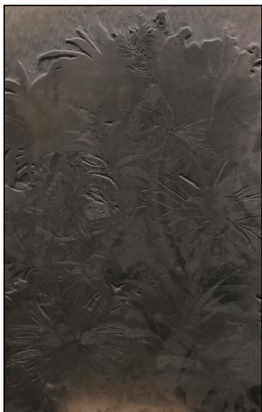
Master, original carved block