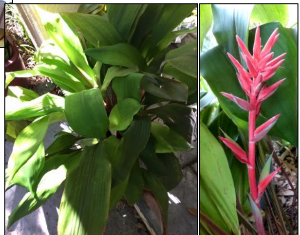
Pitcairnia sanguinea x Pit. undulata