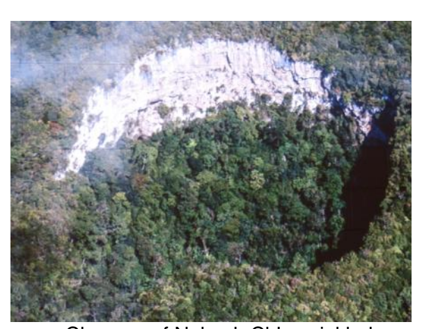
Close up of Nohoch Ch'en sinkhole