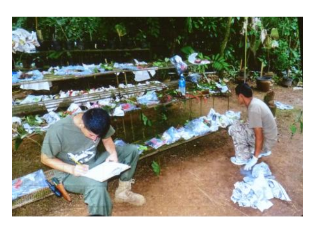
Documenting, recording, packaging specimens