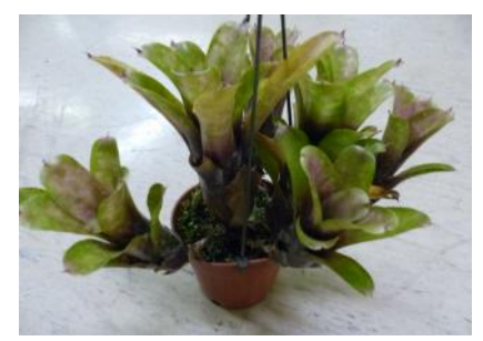
Neoregelia 'Domino' x 'Marble Throat'