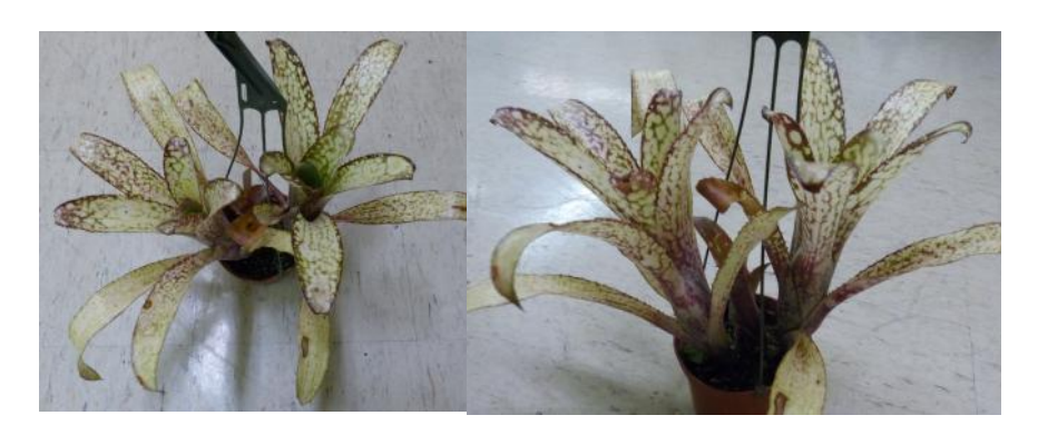
Billbergia 'Fay' x 'Lou Wilson'