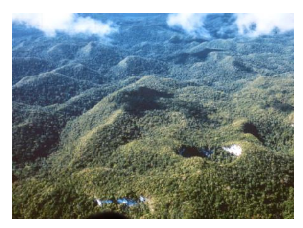
Chiquibul Wilderness and Nohoch Ch'en cenote (lower right)

Bruce Holst gave us a presentation titled Belize: Into the Deep that took us on a 2014 expedition into the 425-foot deep Nohoch Ch'en cenote (i.e., sinkhole) located in the Chiquibul National Park in the Chiquibul Wilderness in western Belize, the most remote, rugged, unexplored location in the country. (See aerial views below). The goals of the 10-day expedition were to survey geological features around and in the cenote, descend into the cenote and record and study the flora and fauna there and collect botanical specimens.