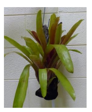
Aechmea 'Foster's Favorite'