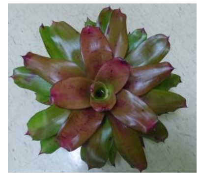
Neoregelia 'Jungle Gem'