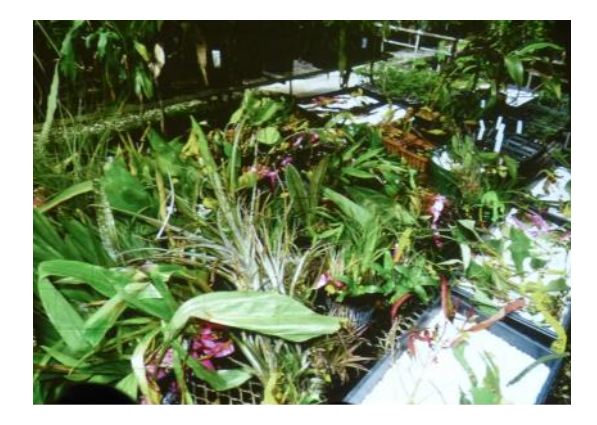
Botanical specimens collected

Back at the Caves Branch Jungle Lodge they organized, documented, recorded, and packaged both live plants and herbarium specimens (pictures below). The team collected an estimated 400 species, of which 250 were live specimens and 280 were processed into herbarium specimens. Both the live and pressed specimens were then sorted, shared and deposited at the Marie Selby Botanical Gardens, Caves Branch Botanical Gardens, and the Belize Forestry Department, while herbarium specimens were sent to the National Herbarium of Belize. As part of the project, the team had the opportunity to train the Caves Branch Botanical Gardens' horticulturists on how to collect and cultivate plants and to make herbarium specimens. Additional descents into the Nohoch Ch'en and other sinkholes will hopefully take place on future trips and add to the material collected to date.